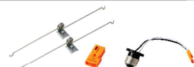
Socket adaptor and spring

FDFM-18W-LED-3K-120V-D FDFM-18W-LED-4K-120V-D