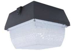
LED GARAGE LIGHTER