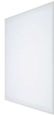
LED PANEL LIGHT