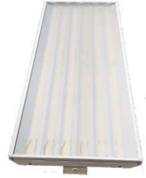
LED HIGH BAY