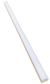
LED LIGHTING BOLT