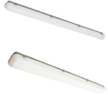
LED VAPOR TIGHT