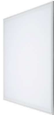
LED PANEL LIGHT